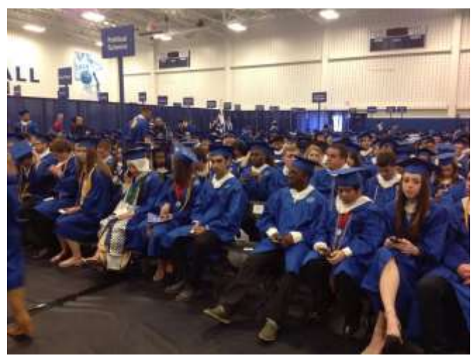
Political Science Class of 2015 prepares to graduate, UB Alumni Arena, May 2015